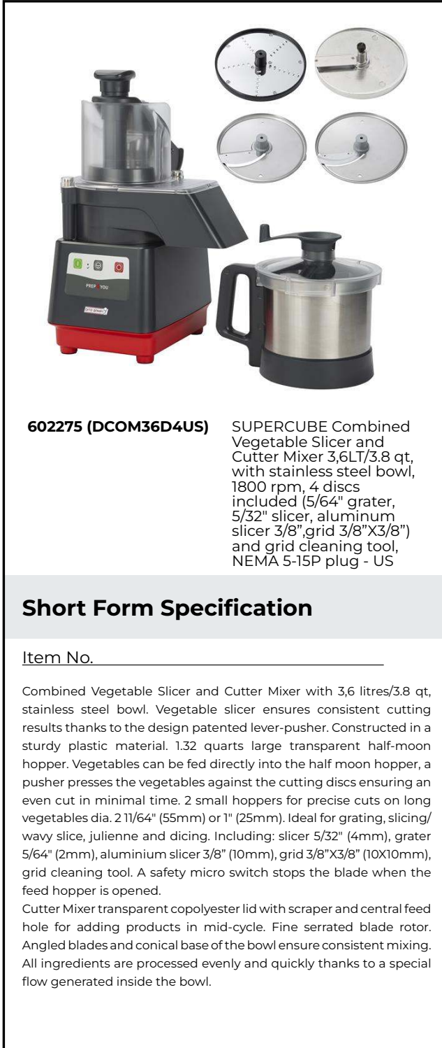
602275 (DCOM36D4US) SUPERCUBE Combined Vegetable Slicer and Cutter Mixer 3,6LT/3.8 qt, with stainless steel bowl, 1800 rpm, 4 discs included (5/64" grater, 5/32" slicer, aluminum slicer 3/8", grid 3/8"X3/8") and grid cleaning tool, NEMA 5-15P plug - US